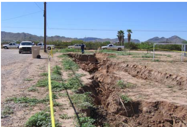
This fissure is the segment of an old fissure that opened up last summer south of Queen Creek (Chandler Heights area) at Happy Road & 195th. This fissure, known as the “Y-Crack”, formed in the early 1960s.

Expansive soil, collapsing soil, and normal settling of fill material can also produce cracks in structures.