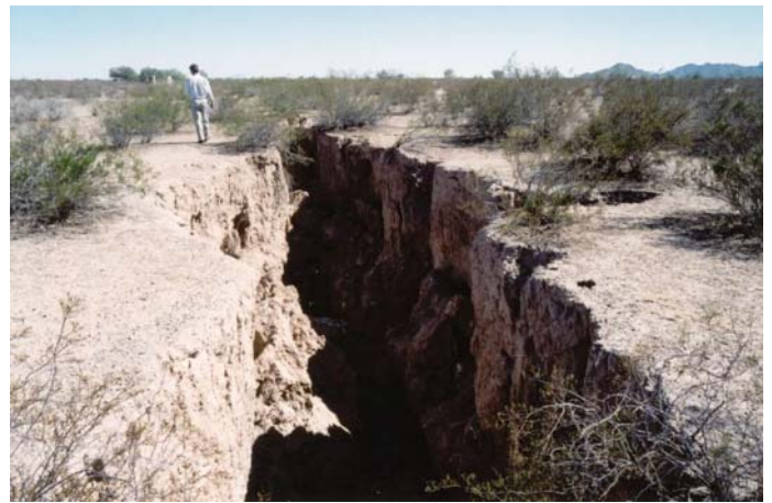
The Rogers Fissure opened in 1997 in the Harquahala plain about 60 miles west of Phoenix following heavy rain from Hurricane Nora. This fissure is about 4,500 feet long.

Although earth fissures seem to appear "overnight" following intense rainfall, the precursor fissure may have been forming for years or even decades at depth. In the earliest stages of development, a fissure may first appear at the surface as a series of small depressions or small cracks only a few inches wide and tens of yards long. Water running into the fissure erodes the sides and washes the material deep down into the fissure system, enlarging the original small crack into an impressive chasm.