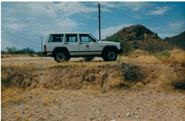
This fissure is along the Hunt Highway near Thompson Road. It is one of the few fissures in Arizona that has vertical offset.

Earth fissures can cause significant damage to infrastructure such as roads, canals, railroads and pipelines. Buildings and houses have been damaged by fissures that opened up beneath them. The presence of cracks in foundations and walls, however, does not necessarily indicate that subsidence or earth fissures are to blame.