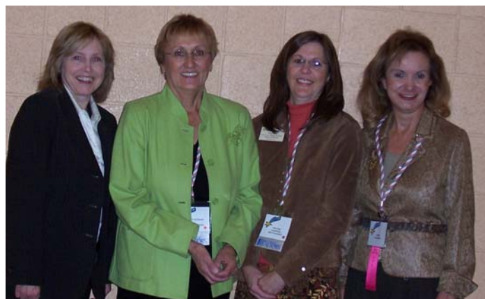
At "The NE Economic Summit" in Payson