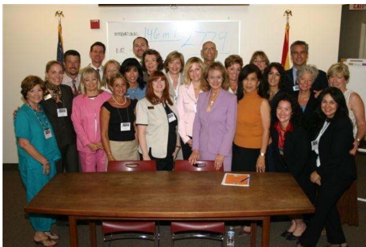
At "Leadership Class X" Scottsdale Area Association of REALTORS®